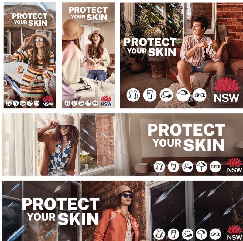
Figure 4. Images from campaign promoting sun protection