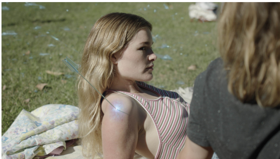
Figure 2. Image from If You Could See UV campaign video advertisement

The Skin Cancer Online Tracking Survey (SCOTS) was used to evaluate the campaign for awareness, impact and engagement. SCOTS comprises a cross-sectional tracking survey of NSW residents aged 13–54 years recruited from an opt-in research-only online panel operated by i-Link Research. Direct invitations were sent to 18–54-year-old panellists and 13–17-year-olds were recruited indirectly via their parents on the panel. The survey was conducted over 15 weeks, from 14 November 2022 to 5 March 2023. The sample size was n = 100 per week, with an additional boost sample of n = 25 , 18–24-year-olds. The weekly sample was stratified by age (25% for each of 13–17 years, 18–24 years, 25–34 years and 35–54 years), location (60% Sydney, 40% regional/rural NSW) and gender (50% females and 50% males). The total sample size was n = 1875 , including n = 750 , 18–24-year-olds. Given that 18–24-year-